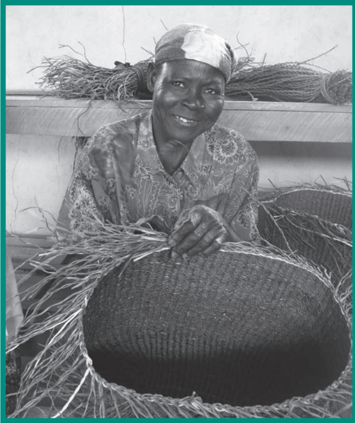
A basket weaver in Ghana works on a sturdy Bolgatanga basket. A recent three-day workshop generated new designs for the artisans.

With erratic rainfall and rocky soil, farmers in the Bolgatanga region of northern Ghana cannot rely on agriculture to support their families. They grow some millet, corn and rice. They raise livestock. But subsistence farming isn't enough. Poverty in villages in the region is widespread; by some estimates it is as high as 80%.